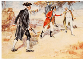
Duelling personalities: Part II Ross v Hill 1791 - A fight for justice