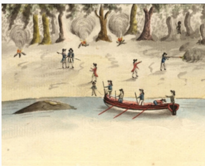
Perspectives on a spearing