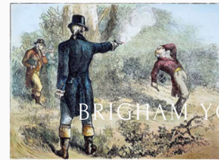
Duelling personalities: Part III Paterson v Macarthur 1801 - Petty grievances