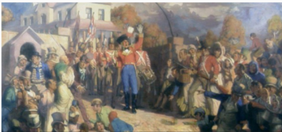
Military mayhem in 1796 - The Baughan Incident