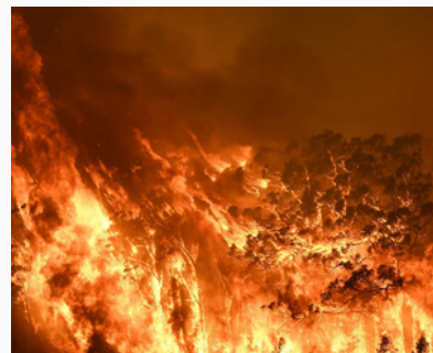
A land of drought and fire