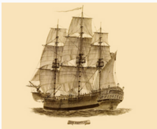
The arrival of the Second Fleet